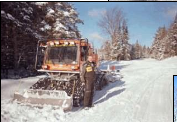
1997 Tucker was freshly painted before moving from Parishville to its new home in South Edwards. (Groomed by Edwards Snowmobile Club)