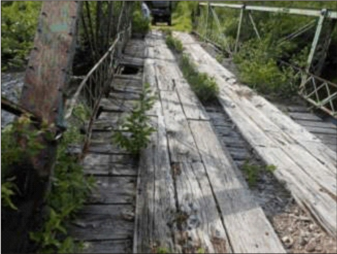
Stone Dam Bridge on (S86) Stillwater Hunting Club