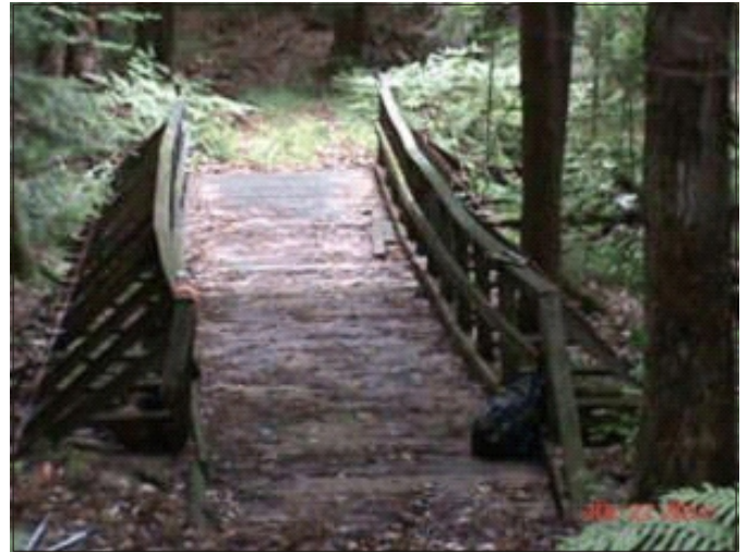
6' wide bridge by Clear Pond (C8) in Parishville