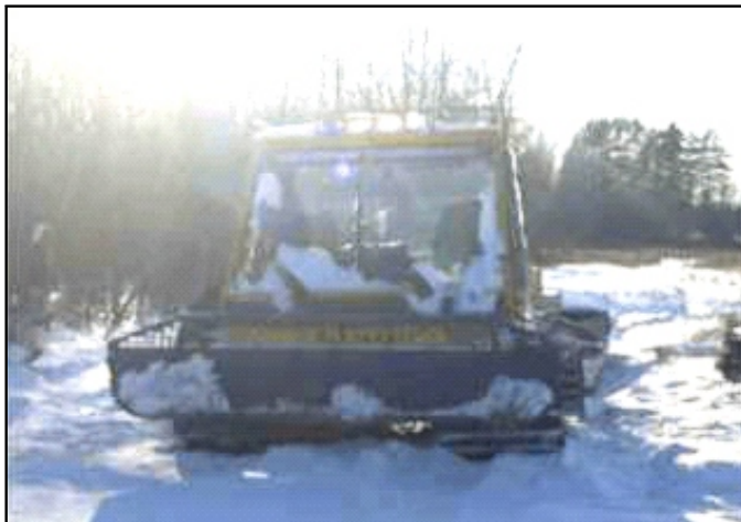
AREA 10 - TRITOWN - 1996 BR160 Purchased 2003/2004 (Groomed by TriTown Trailblazers)