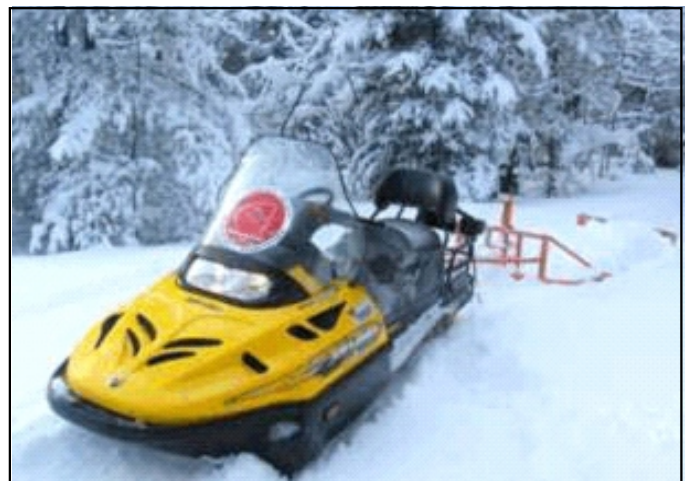
AREA 6 - CHILDWOLD - 2006 Ski Doo WT Purchased 2005/2006 (Groomed by Childwold Snopackers)