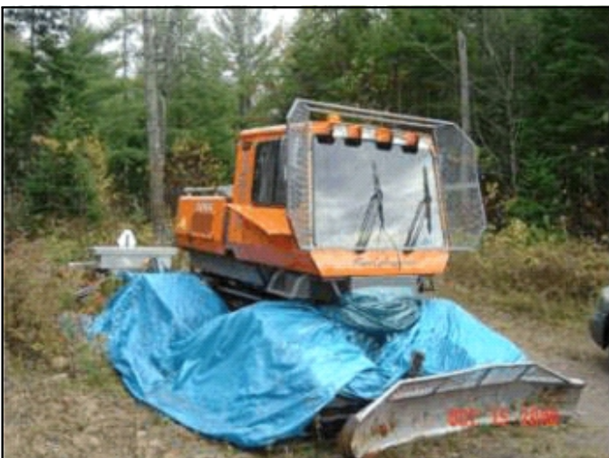
AREA 6 - CHILDWOLD - 1997 Tucker 2000 Purchased 2004/2005 (Groomed by Childwold Snopackers)