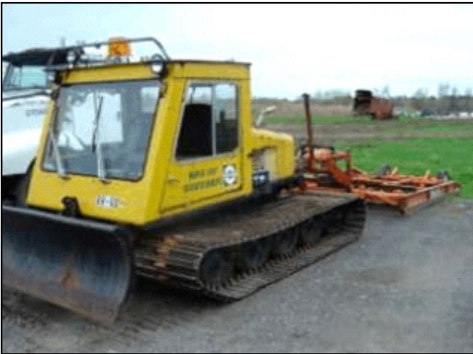
AREA 1 - BLACK LAKE - 1993 Bombadier Br60 Purchased 2003/2004 (Groomed by Dairyland Snowmobile Club)

St Lawrence County is the largest county in the state. We divide our county into grooming areas, to cover a total of 530 miles of funded trails and 140 miles of unfunded trails. We start at Black Lake and worked our way across the county. Take a look at the groomer we use in the area you ride. Maybe next year we can get a picture of the members who give countless hours grooming your area, and give us great trails. We've come a long way with our equipment.