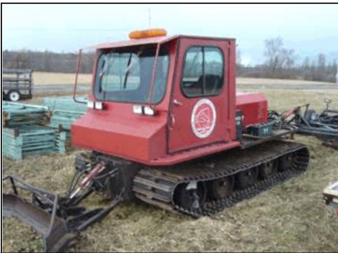
AREA 2 - RENSSELAER FALLS - 1995 Trail Boss Bell Purchased 2003/2004 (Groomed by Punchlock Travelers)