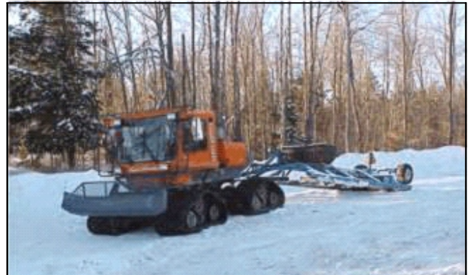
AREA 10- NORTH LAWRENCE - 1997 Tucker 1000 Purchased 2004/2005 (Groomed by SLCSA)