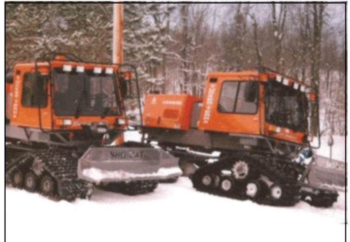
AREA 4 - CLARE Left: 2009 Tucker 1000, Purchased 2009/2010 Right: 2001 Tucker 2000, Purchased 2004/2005 (Groomed by SLCSA)