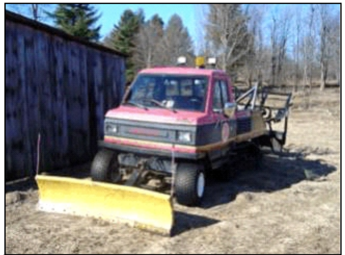
AREA 3 - EDWARDS - 1998 Track Truck Purchased 2004/2005 (Groomed by Edwards Snowmobile Club)