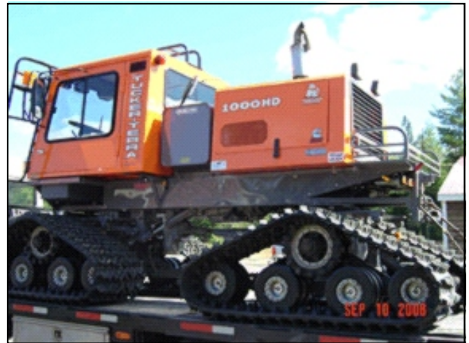
AREA 8- COLTON - 2008 Tucker 1000 Purchased with a separate TEA21 Grant, 2008/2009 (Groomed by SLCSA and Colton Snoskippers)