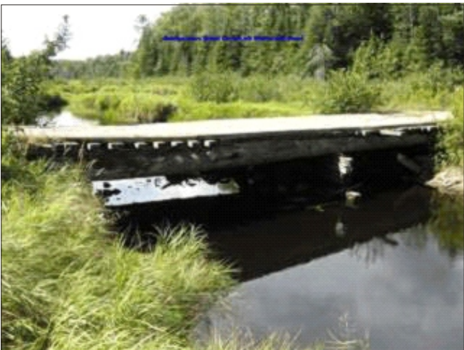
Bridge on Gold Mine Trail (C8) in Parishville