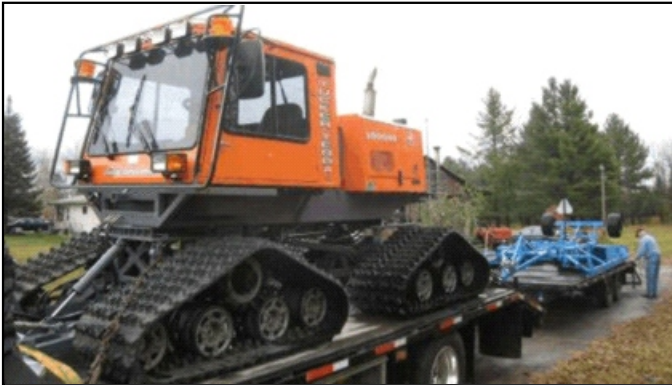
AREA 5 - CRANBERRY 2005 Tucker Terra 1000HD Purchased 2009/2010 (Groomed by Cranberry Lake Mountaineers)