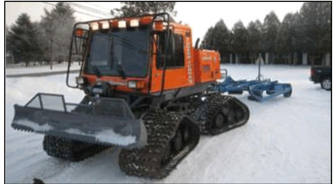
AREA 5 - STAR LAKE 2005 Tucker Terra 1000HD Purchased 2010/2011 (Groomed by Cranberry Lake Mountaineers)