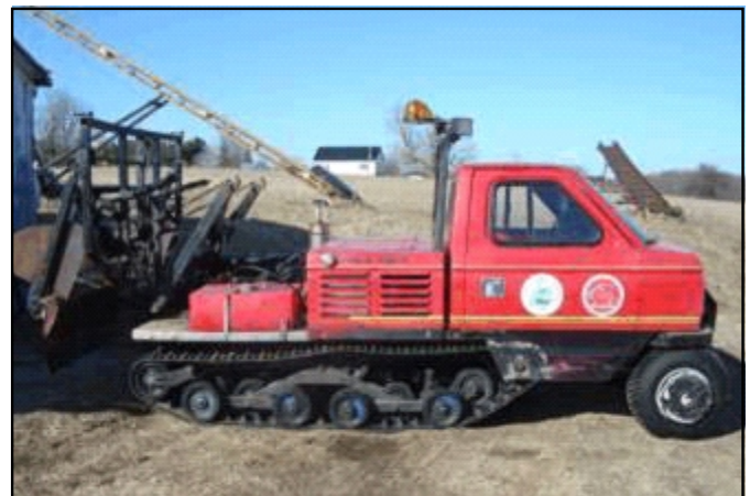
AREA 11 - MADRID - 1986 Track Truck Purchased 2004/2005 (Groomed by Grasse River Groomers)