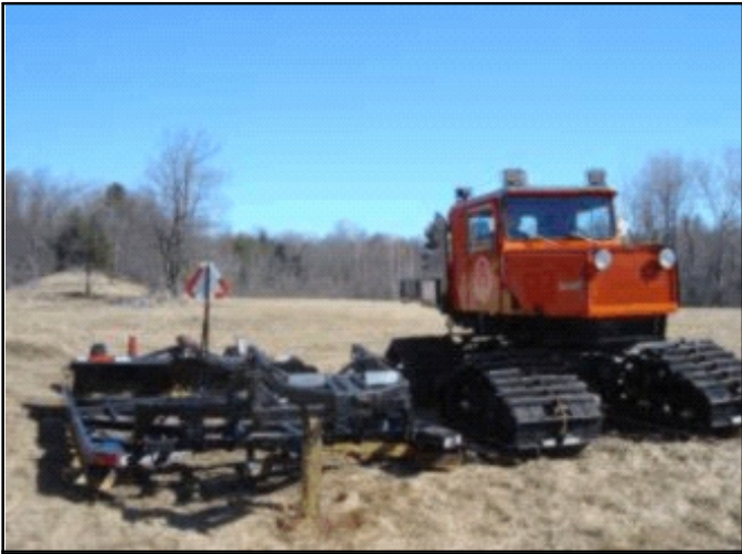
AREA 3 - SOUTH EDWARDS - 1979 Tucker Purchased 1998/1999 (Groomed by Edwards Snowmobile Club)