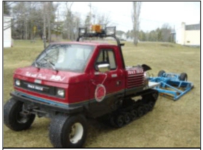
AREA 2 - HEUVELTON - 1991 Track Truck Purchased 1994/1995 (Groomed by Punchlock Travelers)