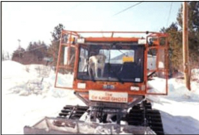
AREA 9- PARISHVILLE- 1997 Tucker 1000 First new Tucker purchased with TEA21 Grant, 1997/1998 (Groomed by SLCSA)