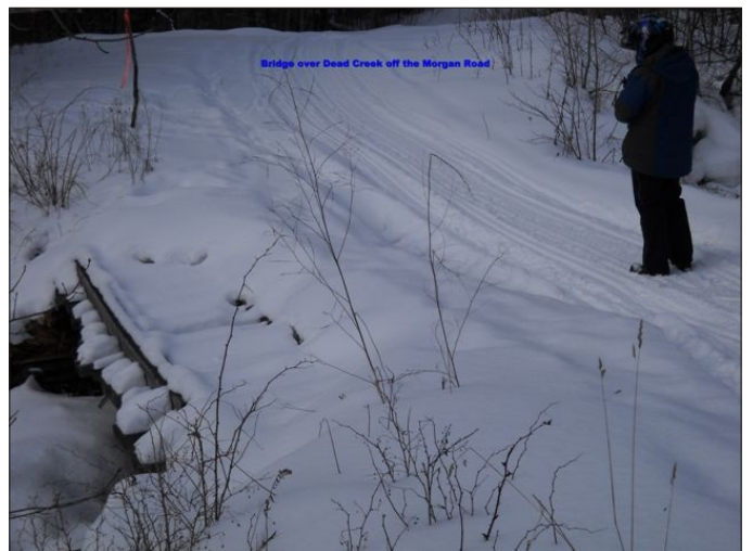
Bridge over Dead Creek off Morgan Rd.

We were changing our junction numbers and needed to take the old one down and put the new one up. This tree had grown so much over the years that it took three guys together to reach the old sign to take down.