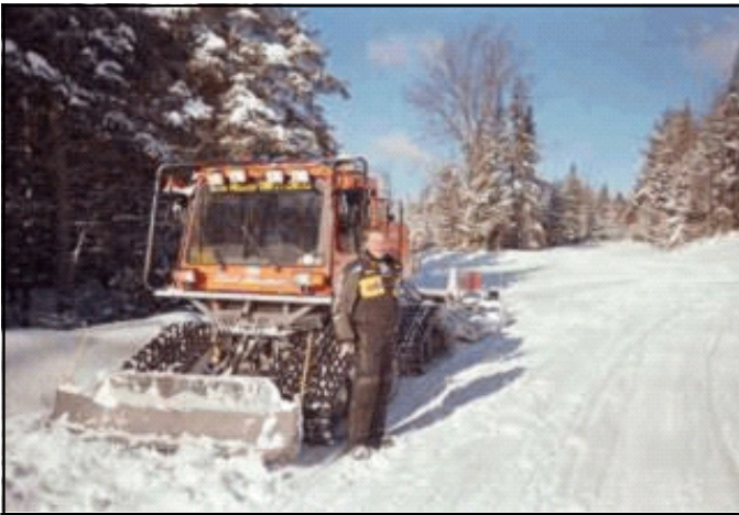
AREA 7- SHURTLEFF'S - 2006 Tucker 1000 Purchased 2006/2007 (Groomed by SLCSA)