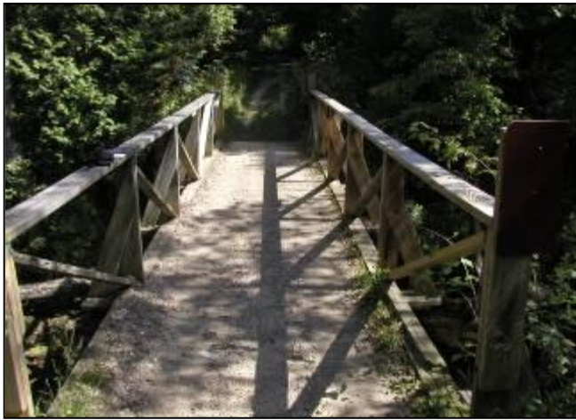
12 x 32 bridge Burns Rd West, Brasher State Forest (before-left and after-right) and decorated for the Holidays!!