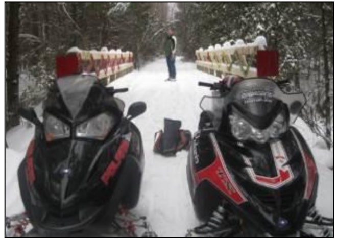
New bridge at the CC Dam in Brasher State Forest – Glu Lam Beams from Wanakena