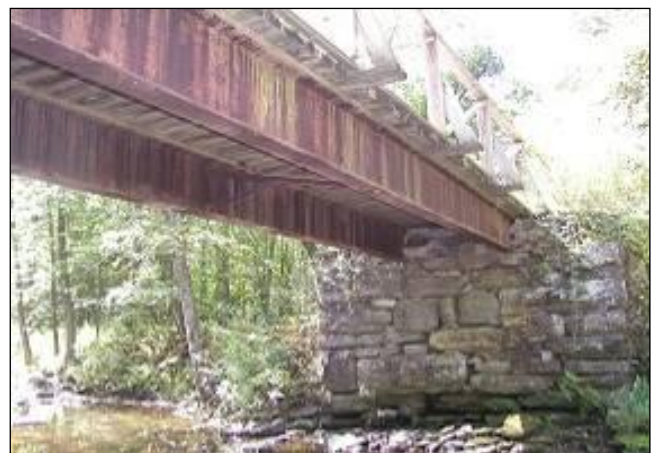
12 x 50 Burns Rd East Bridge, Brasher State Forest.